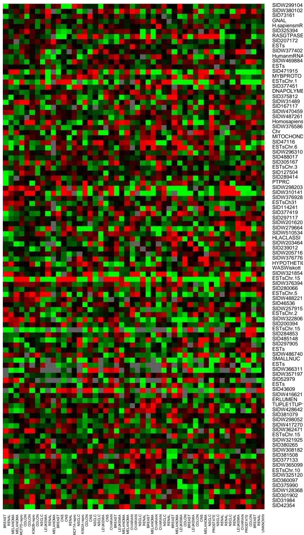
FIGURE 1.3. DNA microarray data: expression ma-